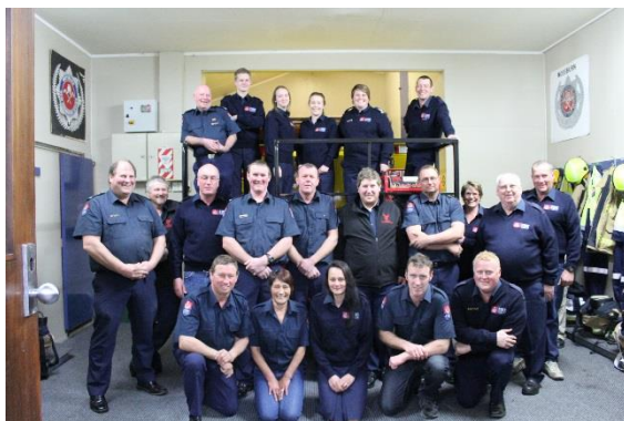
Mossburn Fire Brigade enjoying their new tuck

Southern Rural Fire recently built a new 5000 Litre fire tanker which has been placed at the Mossburn Fire Station. The tanker replaced the old Bedford Tanker that only had a 3000 litre tank. The team were pretty happy to receive this flash upgrade.